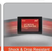
Shock & Drop Resistant